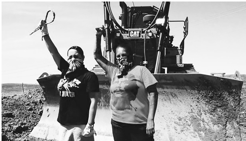
Construction on the DAPL blockaded near the Sacred Stone camp August 2016

itation. We have no leader. We all have knowledge to share and learn from each other. We recognize that the borders we build between ourselves are not "natural" anymore than the flooding in the 1950s by the Army Corps of Engineers is. They do not spread our Wildfire, so we continue to