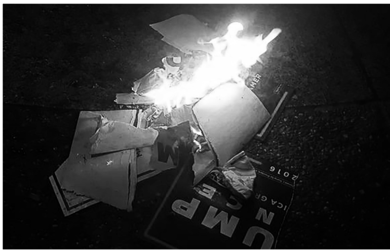
Stolen Trump signs burning outside the Convention Center August 2016

potential of escalating conflict with far-right movements. How would white supremacist groups react to Trump's victory in November? To his loss? What if the loss is narrow, or a landslide? Victory celebrations could become roving mobs attacking people perceived to be of marginalized identities. As far fetched as this may seem, it's already a reality in Europe where the far-right has capitalized on the refugee crisis to expand it's power, in addition to the historical precedent of lynch mobs in the United States. Maybe the reality of a Trump presidency that can't deliver on his promises will lead to a depression